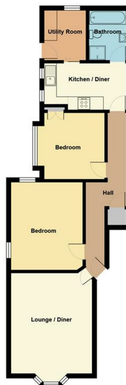
7, Lake Road, Lytham St Annes, FY8 1BE

John Arden & Company for themselves and their clients declare that they have exercised all due diligence in the preparation of these details but can give no guarantee as to their veracity or correctness. Any electrical or other appliances included have not been tested, neither have drains, heating, plumbing and electrical installations. All purchasers are recommended to carry out their own investigations before contract. Details Prepared May 2025